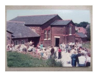
Outdoor service 1995