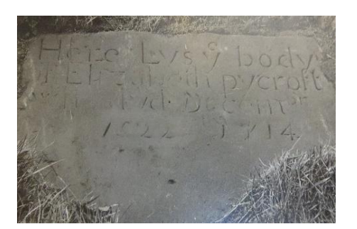
Gravestone dates altered 1692 to 1622; 1714 to 1522