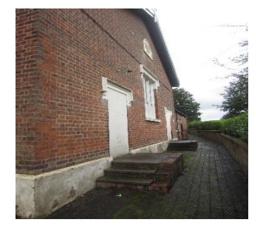
Entrance before 1984

From 1715 until 1945 the church had stables, and there was only a small area against Red Lane for parking cars. A major change in 1982 was a new access road to an off-road car park, with the opening two years later of the 'Link' which joined the schoolroom to the sanctuary and placed the entrance on the opposite side of the building.