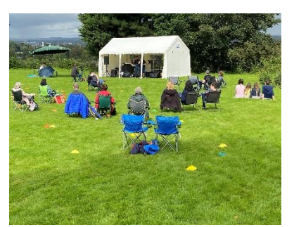
Outdoor Service Sept. 2020

https://www.hillcliffe.info/Groups/348673/Sunday_9_August.aspx